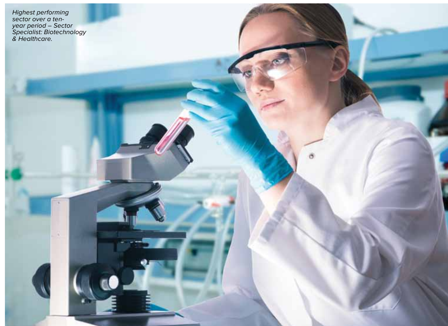
Highest performing sector over a ten-year period – Sector Specialist: Biotechnology & Healthcare.